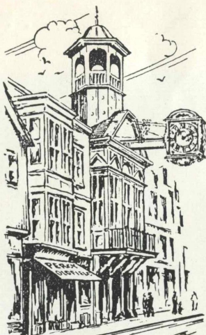
"Under the Clock"