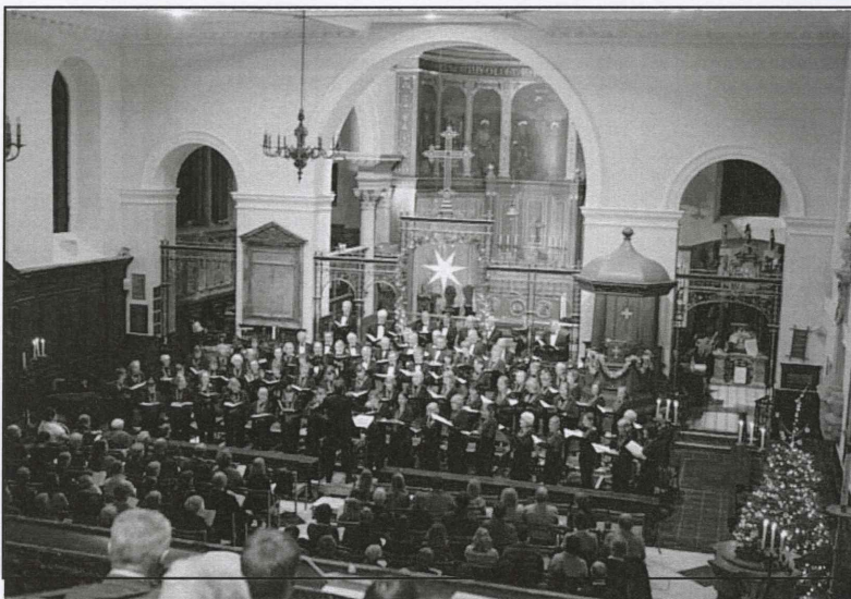
Vivace Chorus performing at the Mayor's Concert 2015